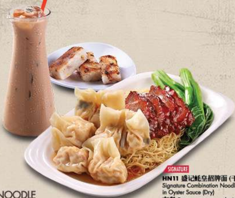
SIGNATURE HN11 盛记蚝皇招牌面(干) Signature Combination Noodle in Oyster Sauce (Dry) 套餐 Set $13.30 单点 Ala carte $9.30

All sets come with a serving of Pan Fried HK Carrot Cake and Iced Milk Tea. 所有套餐包括一份港式煎萝卜糕和冷奶茶。