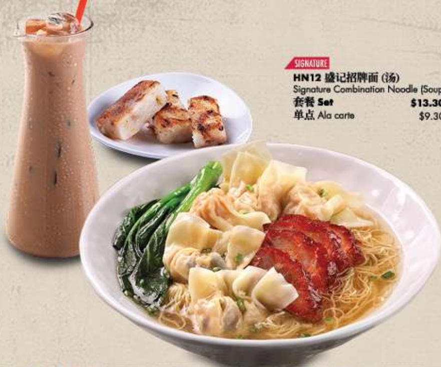
SIGNATURE HN12 盛记招牌面(汤) Signature Combination Noodle (Soup) 套餐 Set $13.30 单点 Ala carte $9.30