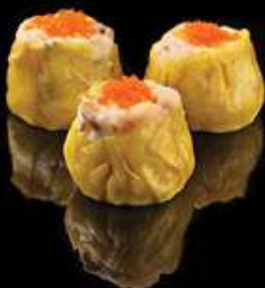
TS02 精装皇牌烧卖 (3件/pcs) Signature Premium Siew Mai $4.50