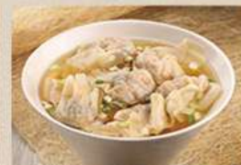
HN10 港式云吞汤 HK Wanton Soup $6.90