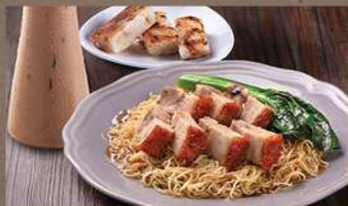
R13 脆皮烧肉面 Crispy Roast Pork Noodle 套餐 Set $12.30 单点 Ala carte $8.30