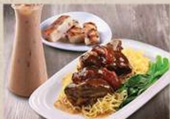
HN03 柱侯牛腩干捞面(干) Braised Beef Brisket Noodle (Dry) 套餐 Set $12.90 单点 Ala carte $8.90