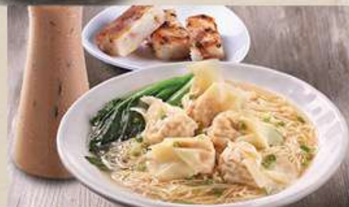
HN07 港式云吞面(汤) HK Wanton Noodle (Soup) 套餐 Set $10.90 单点 Ala carte $6.90