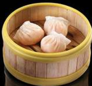
TS16 水晶鲜虾饺 (3件/pcs) Crystal Prawn Dumpling $4.50