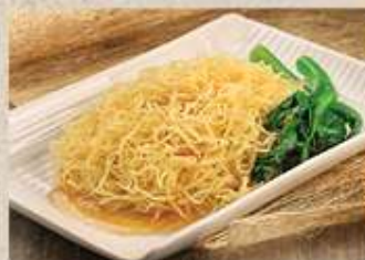
HN08 全蛋面(干) Plain Noodle in Oyster Sauce (Dry) $3.30