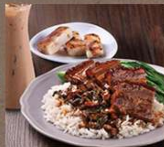
R22 梅菜扣肉饭 Braised Pork Belly with Mui Choy Rice 套餐 Set $12.30 单点 Ala carte $8.30