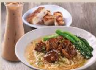
HN04 柱侯牛腩面(汤) Braised Beef Brisket Noodle (Soup) 套餐 Set $12.90 单点 Ala carte $8.90