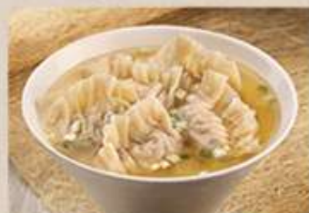
HN05 鲜虾水饺汤 HK Dumpling Soup $6.90