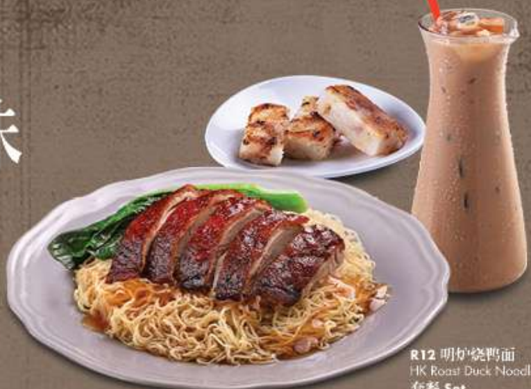
R12 明炉烧鸭面 HK Roast Duck Noodle 套餐 Set $12.30 单点 Ala carte $8.30

All sets come with a serving of Pan Fried HK Carrot Cake and Iced Milk Tea. 所有套餐包括一份港式煎萝卜糕和冷奶茶。