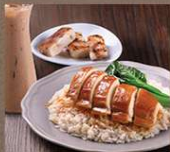
R19 头抽豉油鸡饭 Superior Soy Sauce Chicken Rice 套餐 Set $11.30 单点 Ala carte $7.30