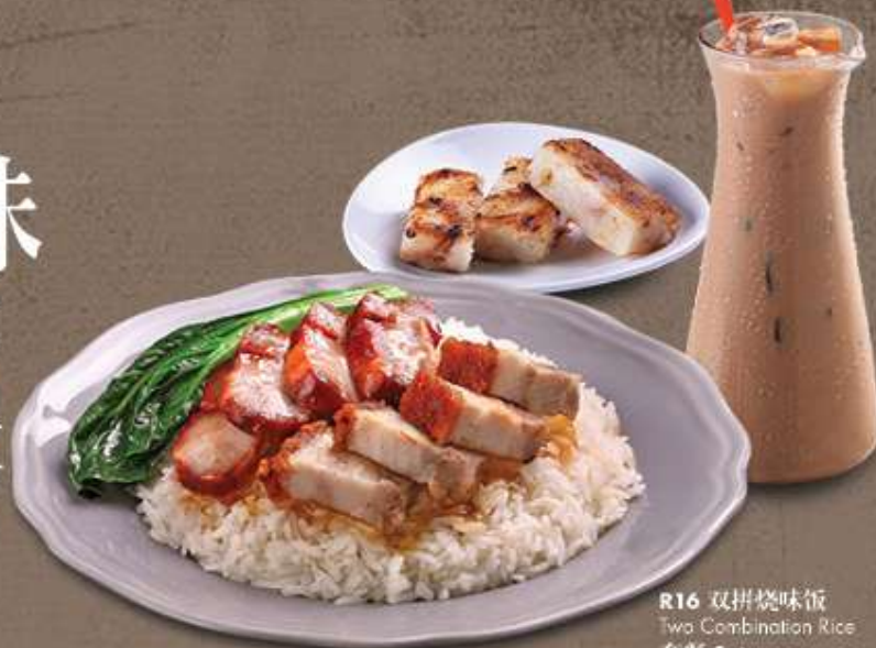
R16 双拼烧味饭 Two Combination Rice 套餐 Set $13.30 单点 Ala carte $9.30