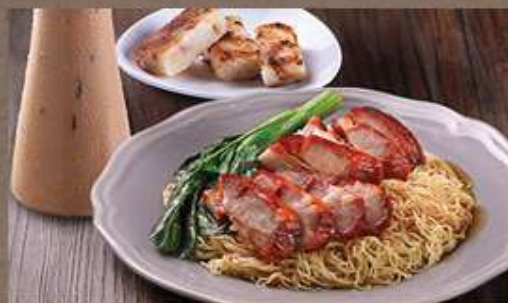
R15 明炉蜜汁叉烧面 Honey 'Char Siew' Noodle 套餐 Set $11.30 单点 Ala carte $7.30