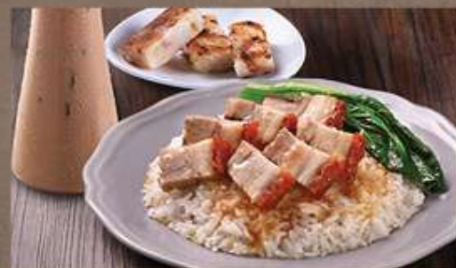
R18 脆皮烧肉饭 Crispy Roast Pork Rice 套餐 Set $12.30 单点 Ala carte $8.30