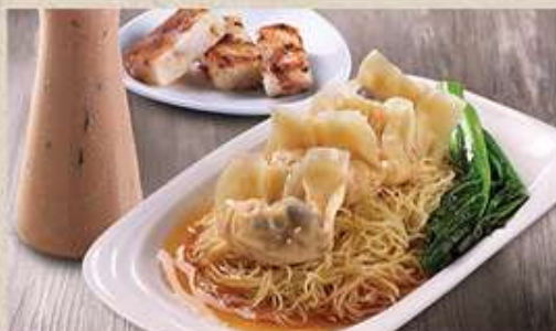
HN01 香港蚝皇水饺面(干) HK Dumpling Noodle in Oyster Sauce (Dry) 套餐 Set $10.90 单点 Ala carte $6.90