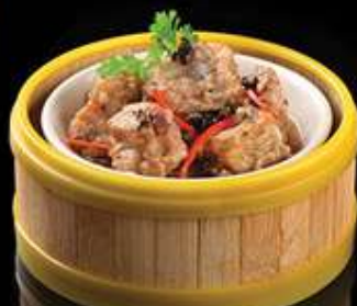
TS08 豉汁蒸排骨 Steamed Pork Ribs with Black Bean Sauce $4.20