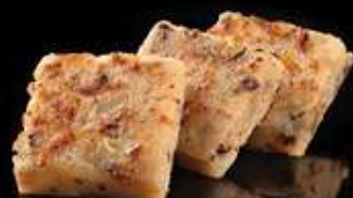
TS11 港式煎萝卜糕 (3件/pcs) Pan Fried HK Carrot Cake $3.60