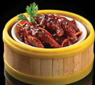
TS05 罗定蒸凤爪 Steamed Chicken Feet $4.20