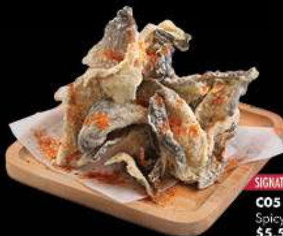
CO5 味椒炸鱼皮 Spicy Crispy Salmon Skin $5.50