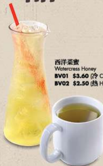
西洋菜蜜 Watercress Honey BV01 $3.60 (冷 Cold) BV02 $2.50 (热 Hot)