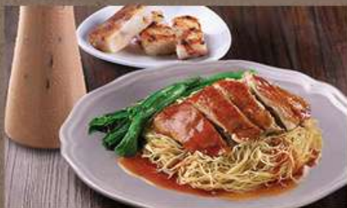
R14 头抽豉油鸡面 Superior Soy Sauce Chicken Noodle 套餐 Set $11.30 单点 Ala carte $7.30