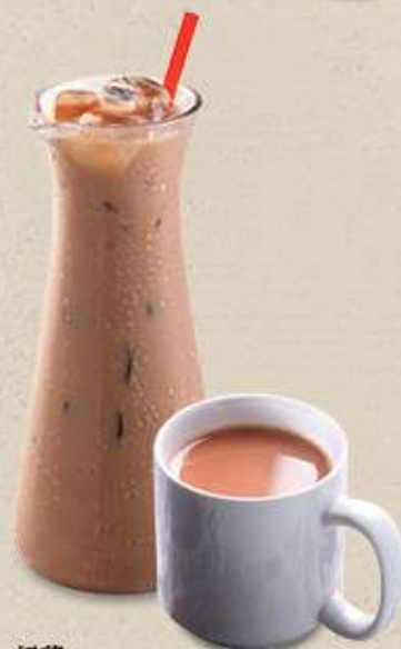
奶茶 Milk Tea BV12 $3.60 (冷 Cold) BV13 $2.50 (热 Hot)