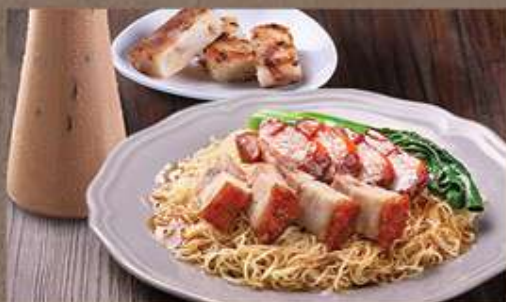
R11 双拼烧味面 Two Combination Noodle 套餐 Set $13.30 单点 Ala carte $9.30