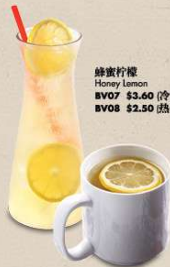
蜂蜜柠檬 Honey Lemon BV07 $3.60 (冷 Cold) BV08 $2.50 (热 Hot)