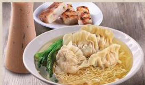
HN02 港式水饺面(汤) HK Dumpling Noodle (Soup) 套餐 Set $10.90 单点 Ala carte $6.90