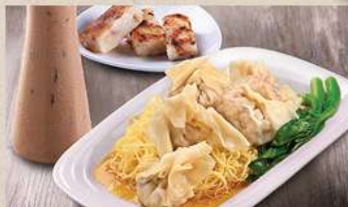
HN06 港式蚝皇云吞面(干) HK Wanton Noodle in Oyster Sauce (Dry) 套餐 Set $10.90 单点 Ala carte $6.90