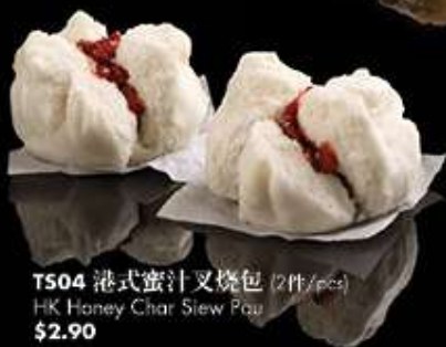
TS04 港式蜜汁叉烧包 (2件/pcs) HK Honey Char Siew Pau $2.90