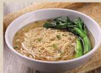
HN09 全蛋面(汤) Plain Noodle (Soup) $3.30