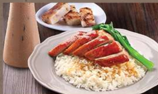
R17 明炉烧鸭饭 HK Roast Duck Rice 套餐 Set $12.30 单点 Ala carte $8.30