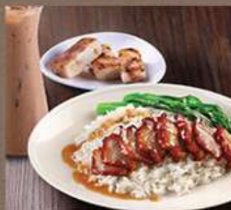
R20 明炉蜜汁叉烧饭 Honey 'Char Siew' Rice 套餐 Set $11.30 单点 Ala carte $7.30